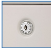
Security Cam Locks