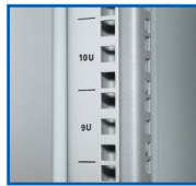
Mounting Pole w/screen UH