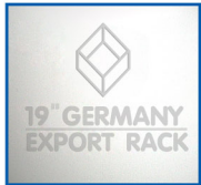
Front Door w/logo