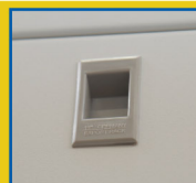
Slide Latch w/logo